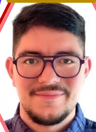
Mr. Monk Support Staff / PE

Our dedicated support staff will be running interventions to help you to reach your full potential.